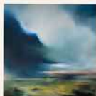
24 Carol No 6 Looking West Em Whitford